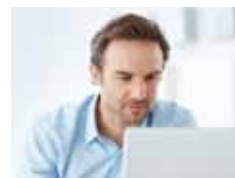
Administration and monitoring in real time